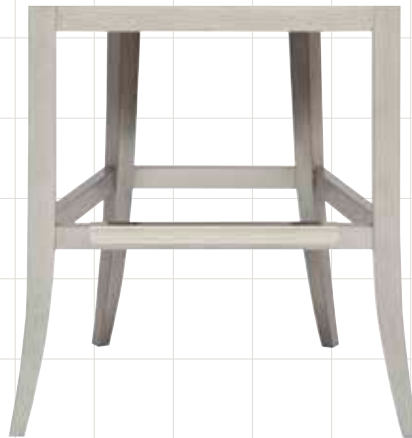
FLARE BASE Wood Species: Maple Kick Plate: Antique Brass or Brushed Nickel