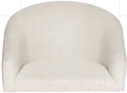
RYDER V66-BS/L66-BS Bar Stool V66-CS/L66-CS Counter Stool