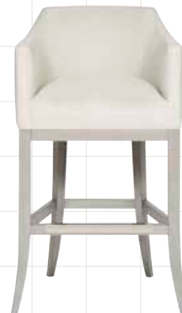
V69-BS Ian Bar Stool Shown with Flare Base