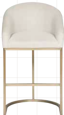
V66-BS Ryder Bar Stool Shown with Metal Barrel Base