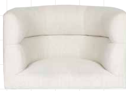
EMMETT V68-BS/L68-BS Bar Stool V68-CS/L68-CS Counter Stool