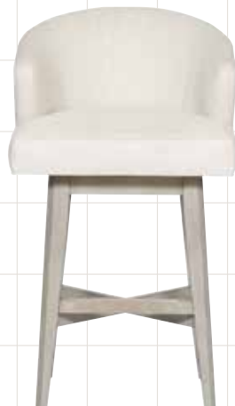
V67-BS Charley Bar Stool Shown with Retro Swivel Base