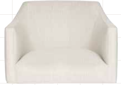
IAN V69-BS/L69-BS Bar Stool V69-CS/L69-CS Counter Stool