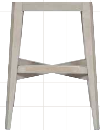
RETRO SWIVEL BASE Wood Species: Maple Kick Plate: Antique Brass or Brushed Nickel