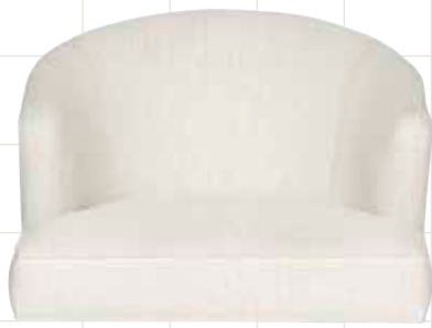
CHARLEY V67-BS/L67-BS Bar Stool V67-CS/L67-CS Counter Stool