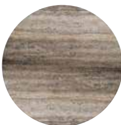
54" Round Stone STR-54 1-1/4" Flat Edge 145 pounds