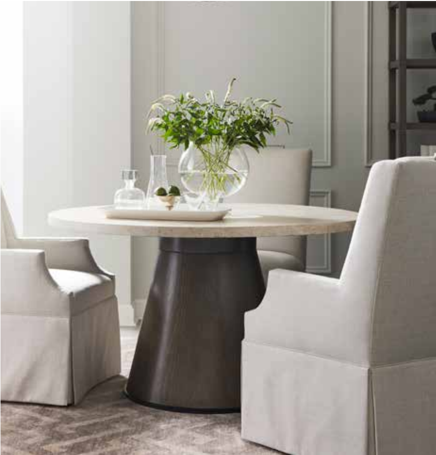
Odion Dining Table Base W221B Shown with optional 54" Round Stone Top in White Travertine (additional charge).