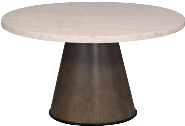
ODION W221B Dining Table Base W 32 D 32 H 29 Ash Solids and Veneers, Metal Rim Base (Flat Black standard) Personalized Finishes Available (stain, paint, metallic paint, MIY paint, artisan stain, premium leaf) Available with all MIY Table Tops