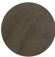
40" Round Wood FE-40 2" Flat Edge 35 pounds