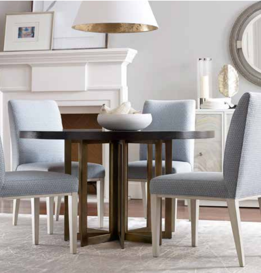
Watkins Dining Table Base P726B Shown with optional 54" Round Wood Top (additional charge).

You can also add our Performance Top Coat to your piece — designed to ensure the longevity of wood furniture. Offering premium resistance to heat, moisture, cleaners, and abrasion, this extra layer protects fine furnishings from scratches, burns and surface damage. It is a highly durable, transparent top coat specifically designed for dining tables, coffee tables, end tables, and furnishings that are used frequently. This premium coating also includes an antimicrobial agent that protects the surface from the growth of microorganisms. While this top coat does add a very slight sheen to the product, it is not a high gloss lacquer, and the piece can still be damaged. Normal cleaning and care instructions (in the Vanguard Price List) should be followed to extend the life of all our wood furnishings. This optional finish is available on every standard paint and stain we offer, excluding leaf finishes. It is standard on all Tinted Metal finish options and is not offered on any “stocked” finishes. *Optional charges may apply.