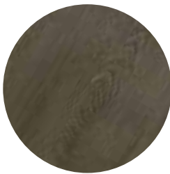
54" Round Wood FE-54 2" Flat Edge 56 pounds