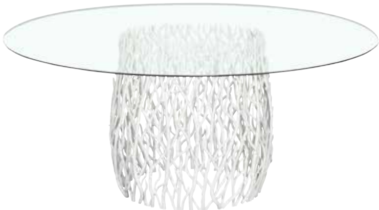
CORAL P678B Dining Table Base W 29 D 29 H 28 White Gesso Metal Available with MIY Glass Table Tops Only