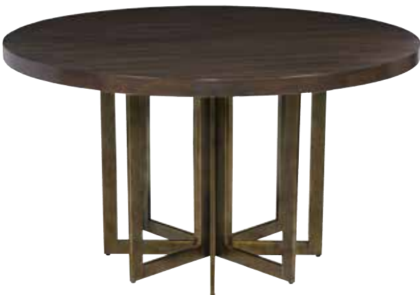
WATKINS P726B Dining Table Base W 28 D 28 H 29.5 French Brass Metal Available with all MIY Table Tops