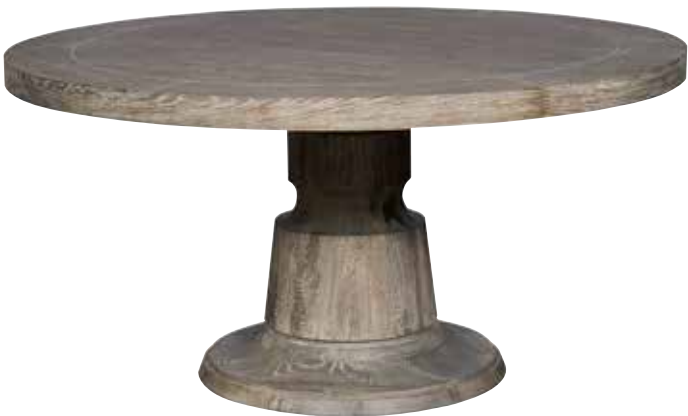
MARVELLE 9101B Dining Table Base W 28.25 D 28.25 H 29 Luxury Composite, Wire Brushed Personalized Finishes Available (paint, metallic paint, MIY paint) Available with all MIY Table Tops