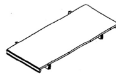
Leaf Extension Assembly (2)